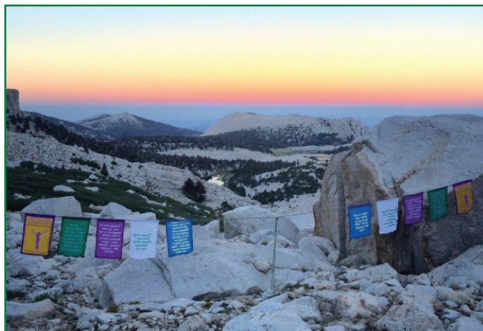
Prayer flags with inspirational sayings brought by the KTS team.

Thank you to these individuals and all who have given their time and support to help further a cure for type 1 diabetes!