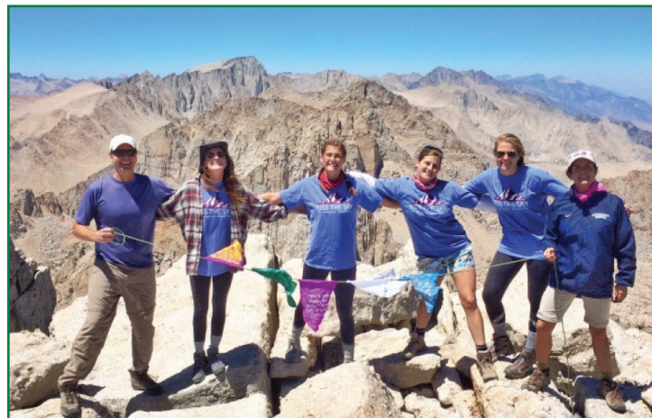
The team reached the summit under clear blue skies.